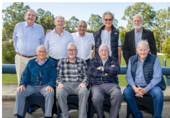
1953 AND 1963 1ST XV RUGBY UNION