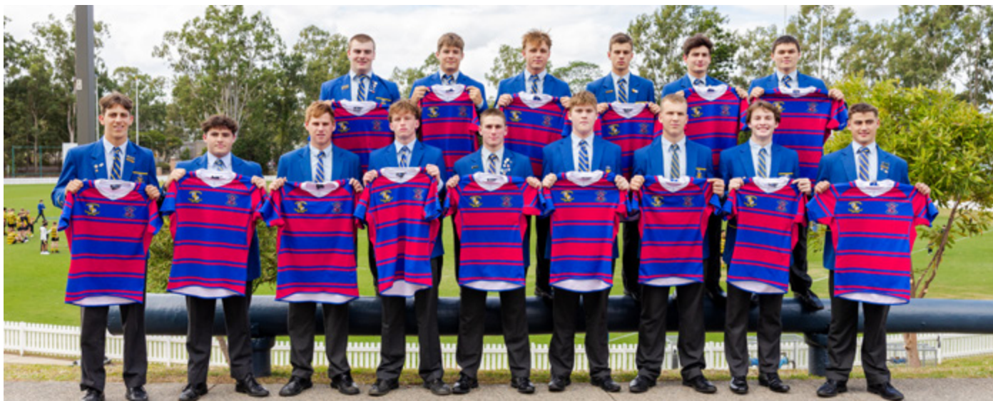
Members of the 1st XV Rugby Union team with the Rosalie tribute jersey.