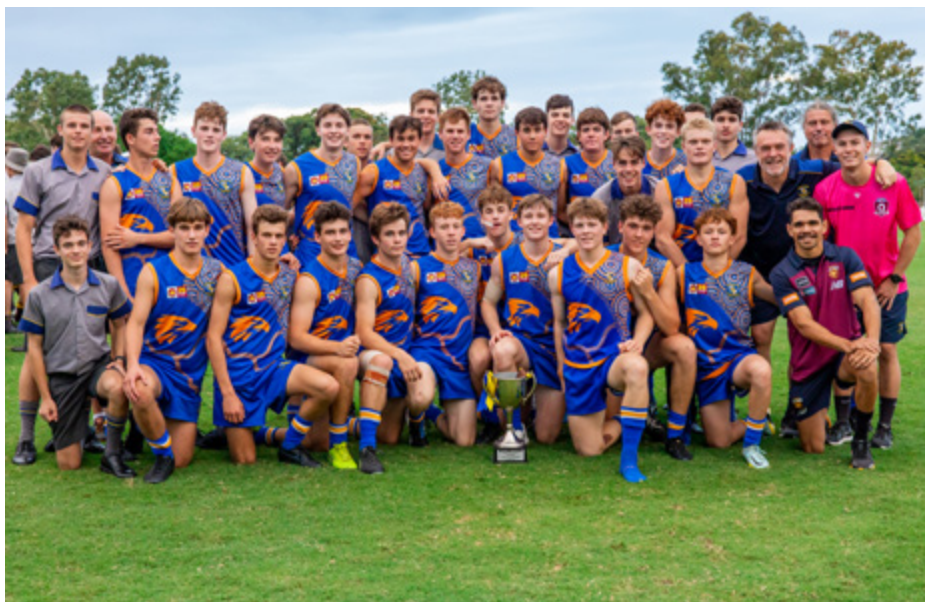
2023 1st XVIII AFL Team