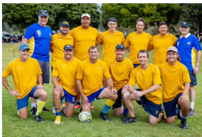
Despite the scoreline, Ashgrove's experienced squad showcased incredible end-to-end running and passing in a thrilling match against Lauries.