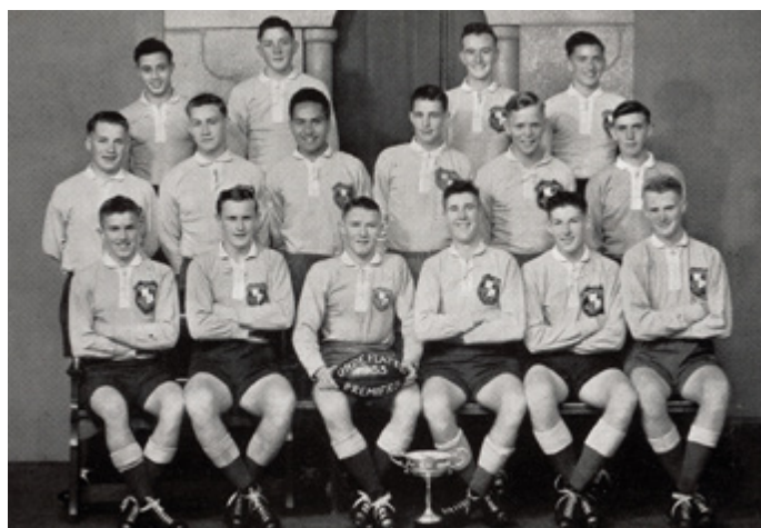
1953 1ST XV RUGBY UNION

The GPS Undefeated Premiers, Nudgee College was the only school team to defeat Ashgrove. Ashgrove defeated BGS, Churchie, BBC and Downlands and every MSSSA College to end the season as Undefeated Premiers. The team included: