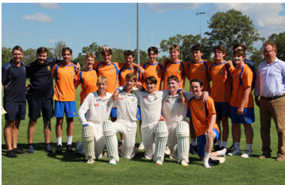
2023 1st XI Cricket Team