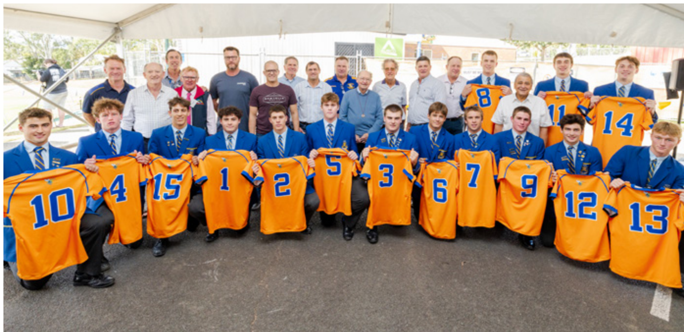
1st XV Rugby Union Jersey Presentation by the Old Boys

On the following pages are some memories of the teams.