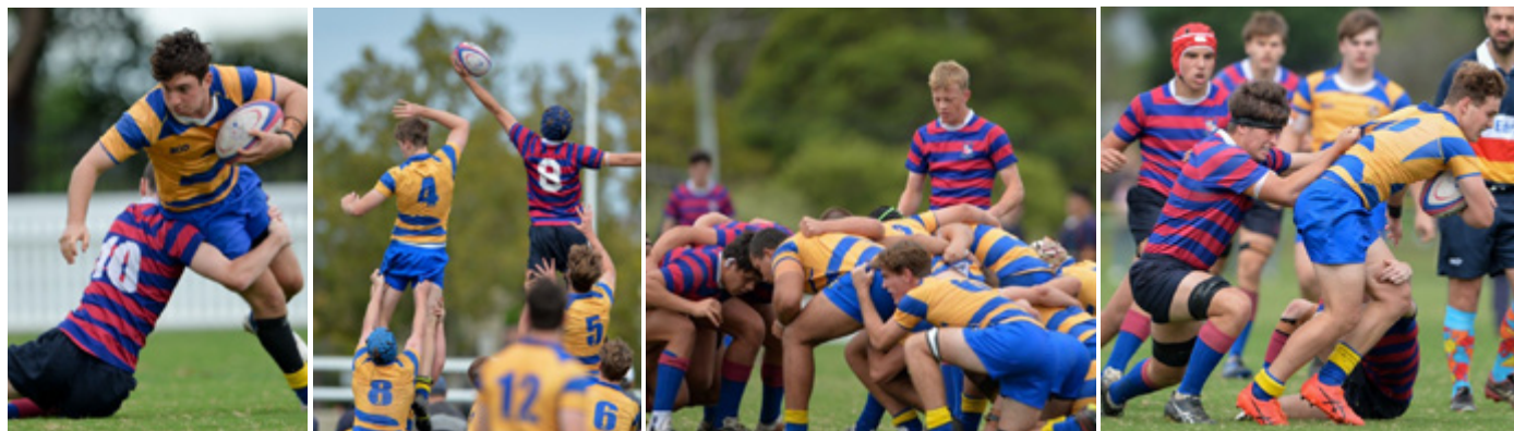
Joeys 'CERISE AND BLUE' v Marist Ashgrove 'BLUE AND GOLD' in Rugby