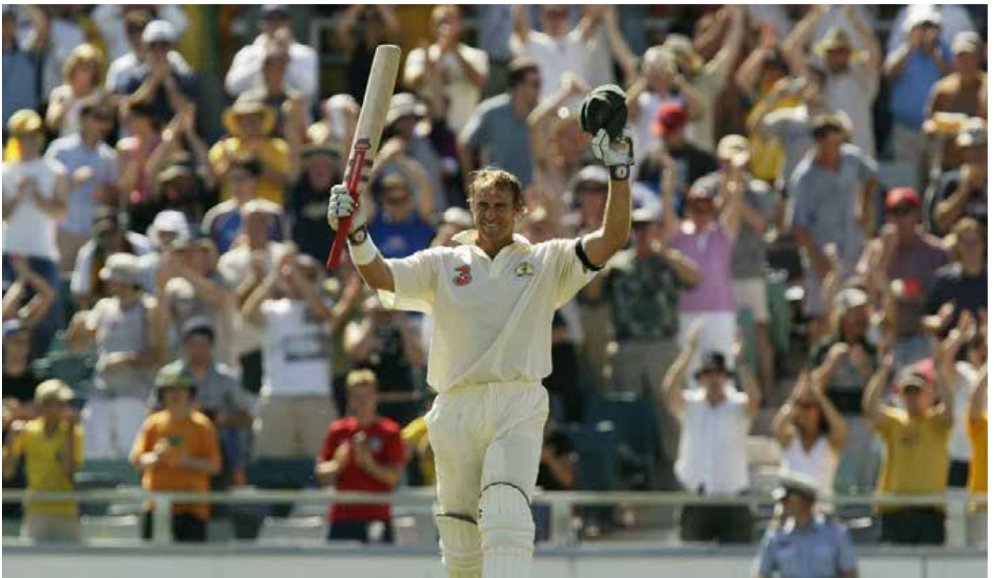
Matt Hayden celebrating after breaking Brian Lara's world record Test score of 375 runs in October 2003 at the WACA, Perth. Matt eventually was dismissed for 380.